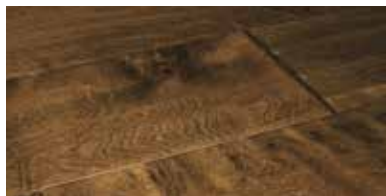
Tobacco Birch SP6TOBB1