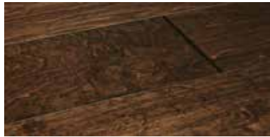
Stout Birch SP6STTB1