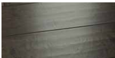
Rosemary Birch SP6ROSB1