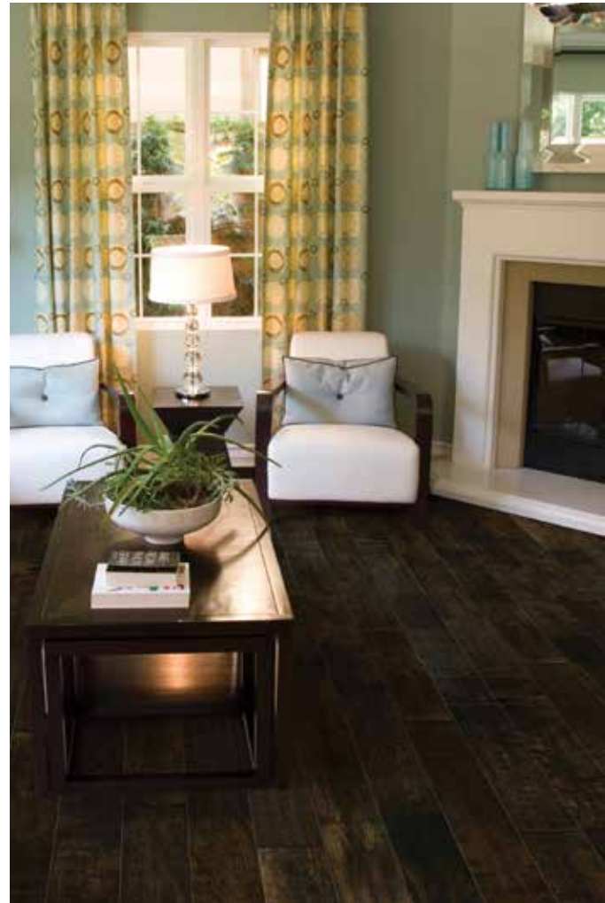
Dark Chocolate Birch