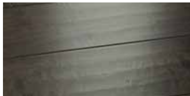
Thyme Birch SP6THYB1