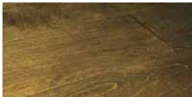
Driftwood Birch SP6DRFB1