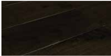
Dark Chocolate Birch SP6DARKB1