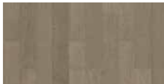
Stetson Hickory CH7HSTE1