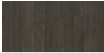
Laredo Maple CH7MLAR1