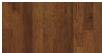
Tackroom Hickory CH7HTAC1