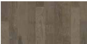
Pendleton Hickory CH7HPEN1