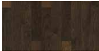
Wrangler Hickory CH7HWRA1