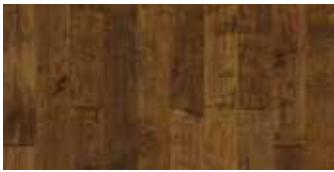
Chaps Maple CH7MCHP1