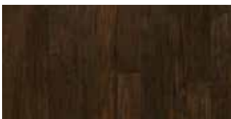
Sagebrush Hickory CH7HSGB1