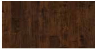
Rustler Maple CH7MRUS1