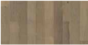
Corral Hickory CH7HCOR1