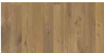
Del Mar Oak AV75ODEL