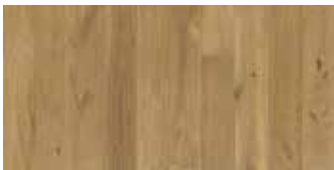
Malibu Oak AV75OMAL