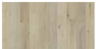
Balboa Oak AV75OBAL