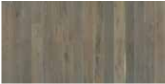
Big Sur Oak AV750Big