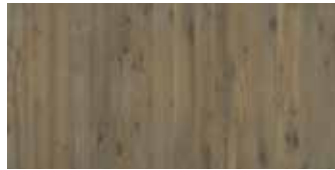
Pismo Oak AV75OPIS