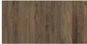
Ojai Oak AV75OOJA