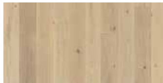
Laguna Oak AV75OLAG