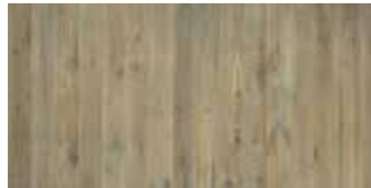
Cambria Oak AV75OCAM