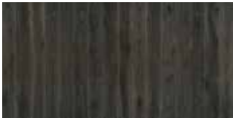
Carlsbad Oak AV75OCAB