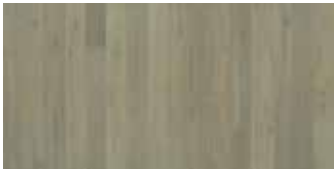
La Jolla Oak AV75OLAJ