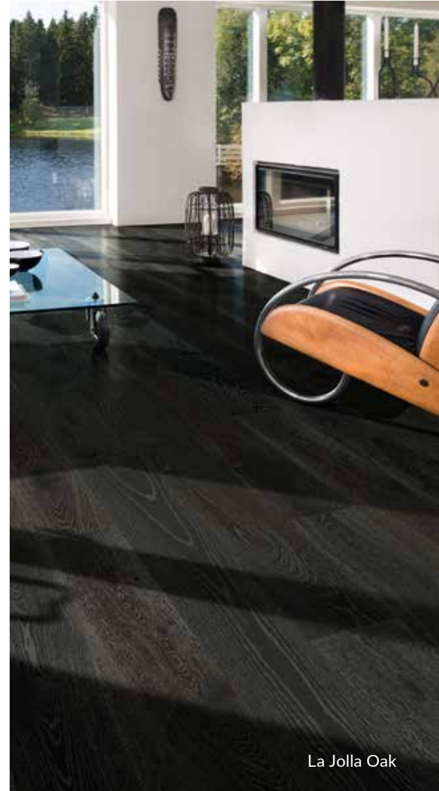
La Jolla Oak