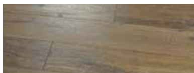
Twain Oak NO6TWAO