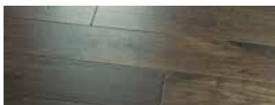
Harper Maple NO6HARM