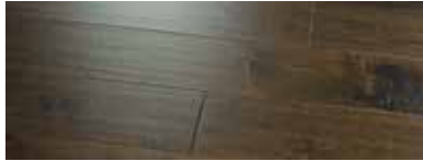
Dickinson Maple NO6DICM