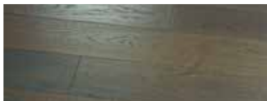
Fitzgerald Oak NO6FITO