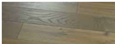
Steinbeck Oak NO6STEO