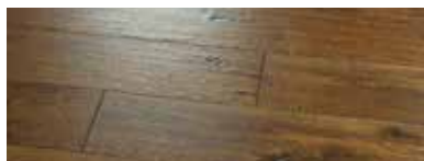
Thoreau Hickory NO6THOH