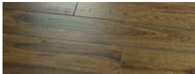
Eliot Hickory NO6ELIH