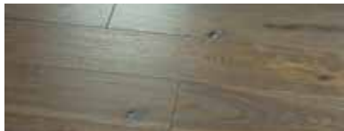
Faulkner Hickory NO6FAUH