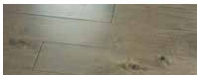
Frost Maple NO6FROM