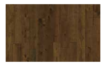
Larsson Hickory GAS6LARH