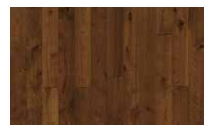
Stickley Hickory GAS6STIH