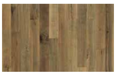
Greene Maple GAS6GREM