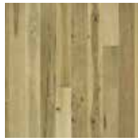
ORANGE BLOSSOM HICKORY V4+