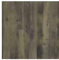
GARDENIA OAK V4