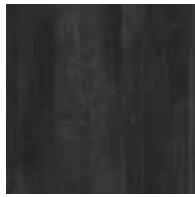
ONYX OAK V3

The True Collection by Hallmark Floors is the very first of its kind and is in a hardwood category all its own.