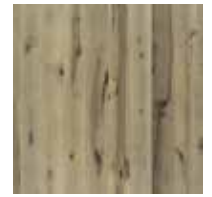
ORRIS MAPLE V4