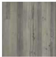
JASMINE HICKORY V4