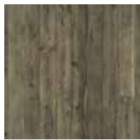
MAGNOLIA HICKORY V3