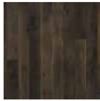
NEROLI OAK V3