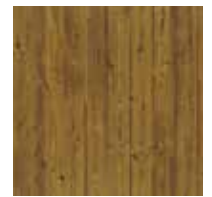
AMBER PINE V3