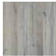
JUNIPER MAPLE V3