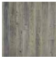
SILVER NEEDLE OAK V3