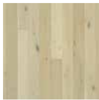
GINGER LILY OAK V4