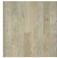
LEMON GRASS OAK V4