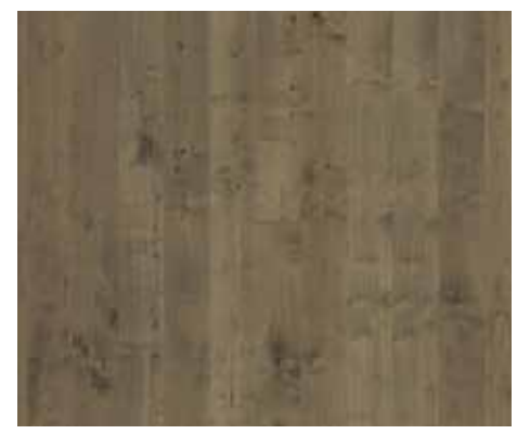
COMPASS MAPLE RE6COMM