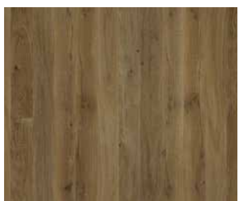
LEEWARD OAK RE6LEEO