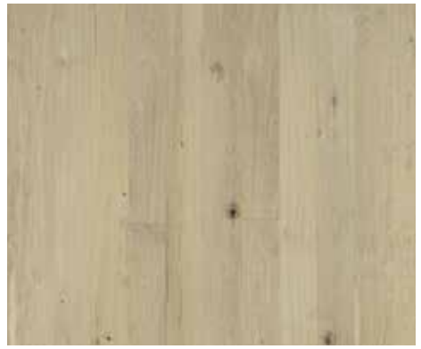
HALYARD OAK RE6HALO