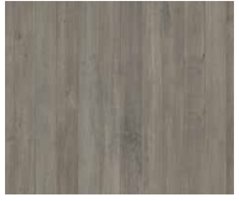
BALLAST MAPLE RE6BALM