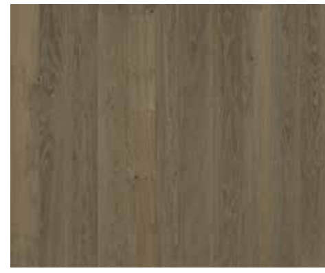
ANCHOR OAK RE6ANCO