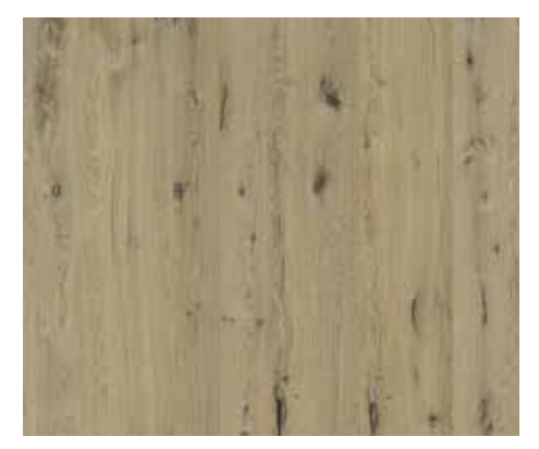
SPINNAKER OAK RE6SPIO