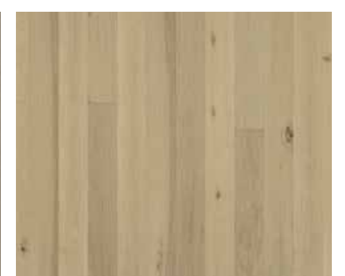
KETCH HICKORY RE6KETH