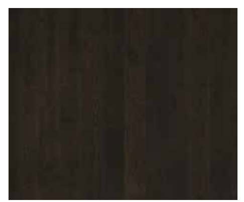
HARBOR OAK RE6HARO