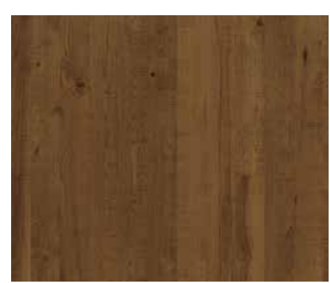
PORT HICKORY RE6PORH