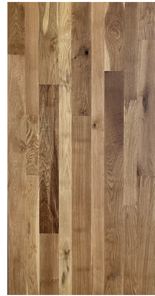
HAND SCRAPPED OAK