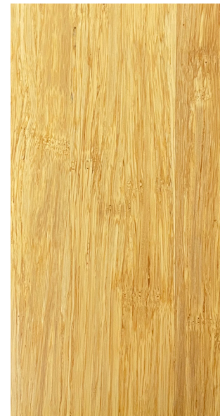
WHEAT STRAND BAMBOO