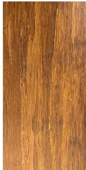
CHESTNUT STRAND BAMBOO