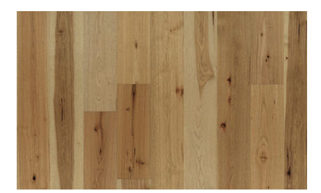
Belle Meade Hickory AVE95BELH