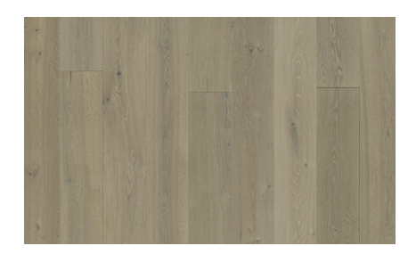
Sunset Oak AVE95SUNO