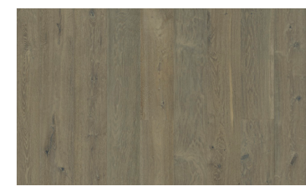
Rodeo Oak AVE95RODO