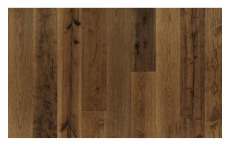
Newbury Hickory AVE95NEWH