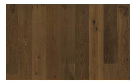
Mulholland Oak AVE95MULO