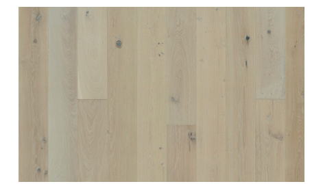
Ocean Drive Oak AVE95OCEO