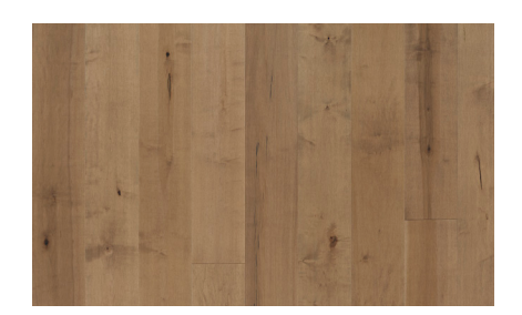
Pennsylvania Maple AVE95PENM