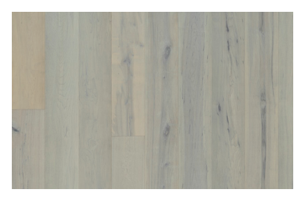
Lombard Maple AVE95LOMM