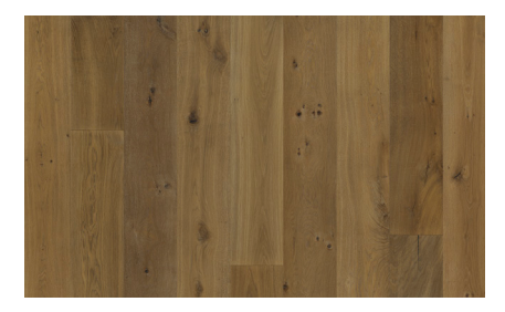
Wilshire Oak AVE95WILO