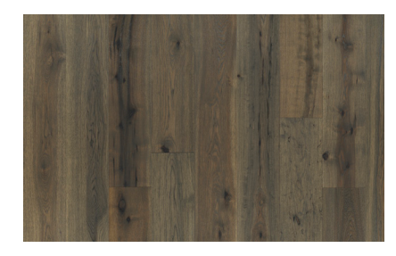
Michigan Hickory AVE95MICH