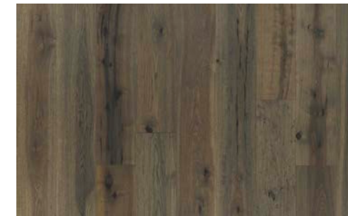
Michigan Hickory AVE95MICH