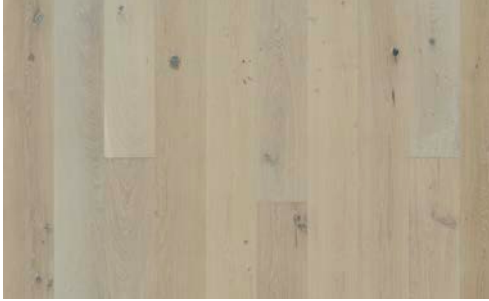
Ocean Drive Oak AVE95OCEO