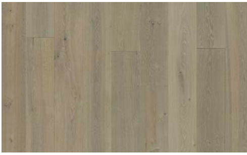
Sunset Oak AVE95SUNO