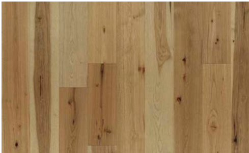
Belle Meade Hickory AVE95BELH