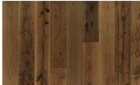
Newbury Hickory AVE95NEWH