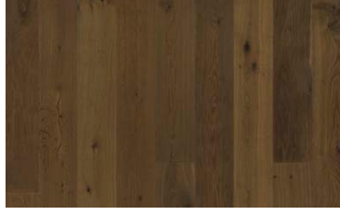
Mulholland Oak AVE95MULO