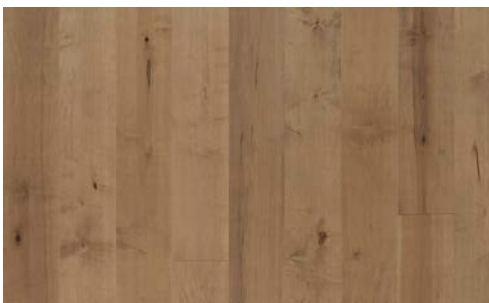
Pennsylvania Maple AVE95PENM