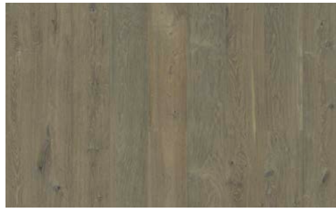
Rodeo Oak AVE95RODO